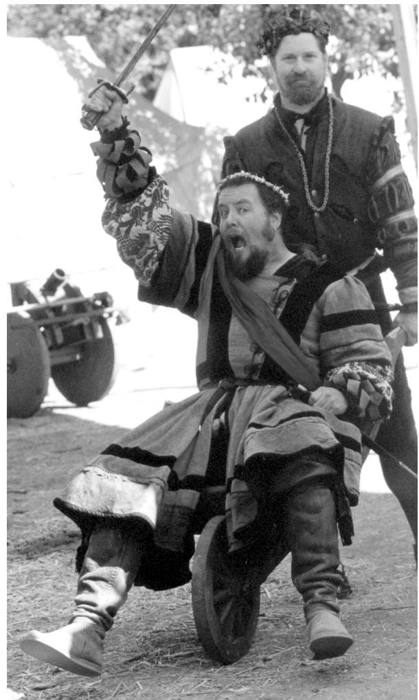
"Ve Commin"

More details will be published prior to the July Meeting of the Imperial Estates along with the candidate letters.