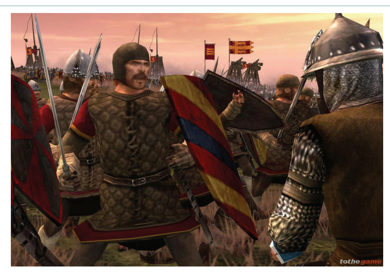
Answer in Next Issue