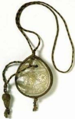
with Tudor roses, popular during the reigns of Elizabeth I and James I. The drawstring has a pearl-shaped tassel of silk and silver-gilt thread. (item # T.197-1966)

From the 1600s, these tassels are silk, silver gilt and silver strip and thread bound round wire and parchment strips. Since the purpose of tassels like these was to enhance the visual effect of furniture and hangings they were usually made in eye-catching materials, such as gold and silver thread or brightly-coloured silks.