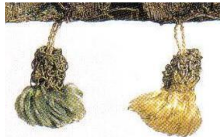
Figure 50 Buttonhole stitch top tassels on a purse made in Paris about 1334 Victoria and Albet Museum

Numerous sources including Elizabethan Costuming and Elizabethan Arts describe purses with multi tassels attached and in Costume and Fashion under 14 th century Edward II is shown in plate IX and describes on page 215 "a Noble Lady Clothing"... "with gold cord and finishing in a tassel at the end" Also it is noted that Henry VII "wore a steel-blue silk sleeved doublet with braided and with silver, rubies in gold mounts"... "a small white silk sash or scarf is worn which