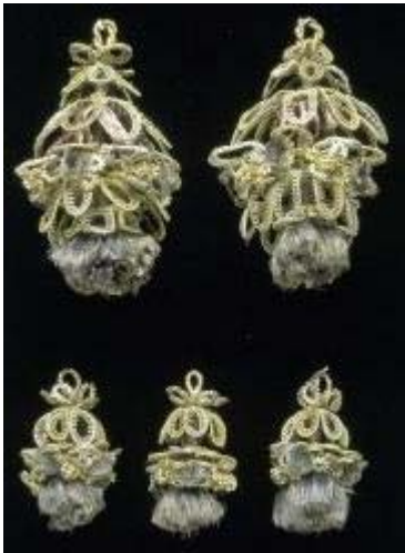
(item T.60 to C-1978)

From the 1600s, these tassels are silk, silver gilt and silver strip and thread bound round wire and parchment strips. Since the purpose of tassels like these was to enhance the visual effect of furniture and hangings they were usually made in eye-catching materials, such as gold and silver thread or brightly-coloured silks.